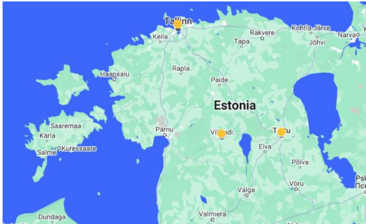
Loovlinnad: Tallinn, Tartu, Viljandi