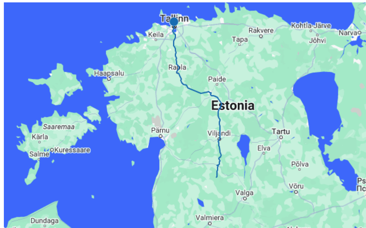
Maailma mälu: Hansa liidu dokumendipärand Balti keti dokumendipärand